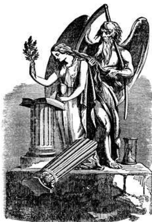
Illustrated History and Cylopedia of Freemasonry Robert Macoy . Masonic Publishing Co.

“We ARE Masons Awareness Renewal Education”