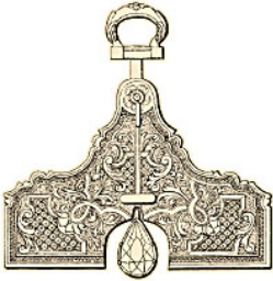
Senior Warden's Jewel: The Level

I would like to introduce myself to the brethren of Anchor Lodge #7 for whom I have not had the pleasure of meeting.