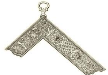
Worshipful Master's Jewel: The Square

Today, we continue to utilize the trestle board as a means to communicate the craft's labors. However, we also have an opportunity to use this tool to